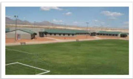
Summit View Youth Center