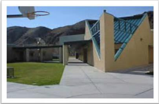
Caliente Youth Center