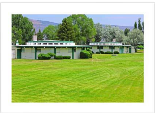
Nevada Youth Training Center