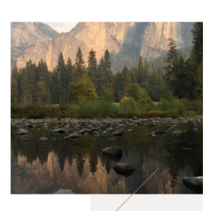
Youth MOVE Podcast

YMNV Podcast - Children's Mental Health Awareness