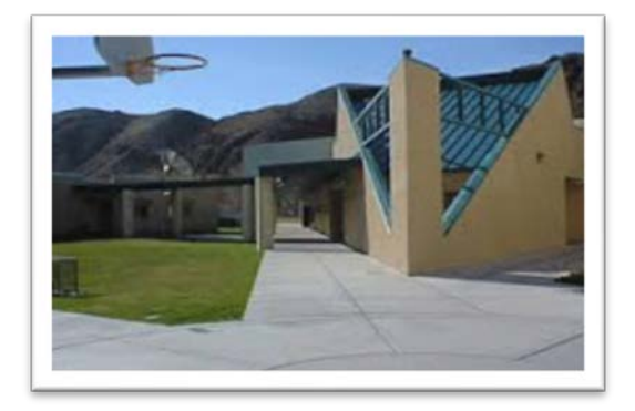
Caliente Youth Center