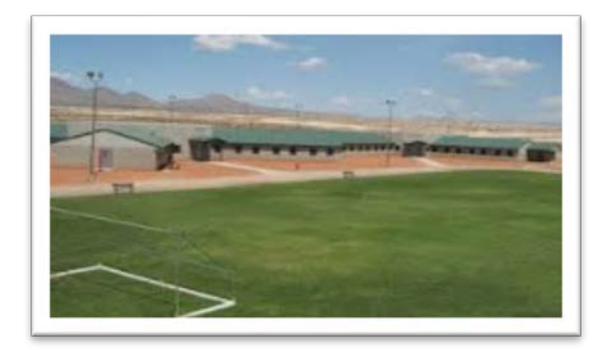
Summit View Youth Center