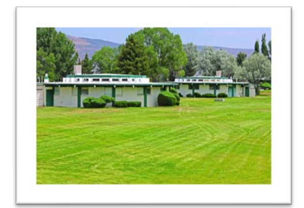
Nevada Youth Training Center